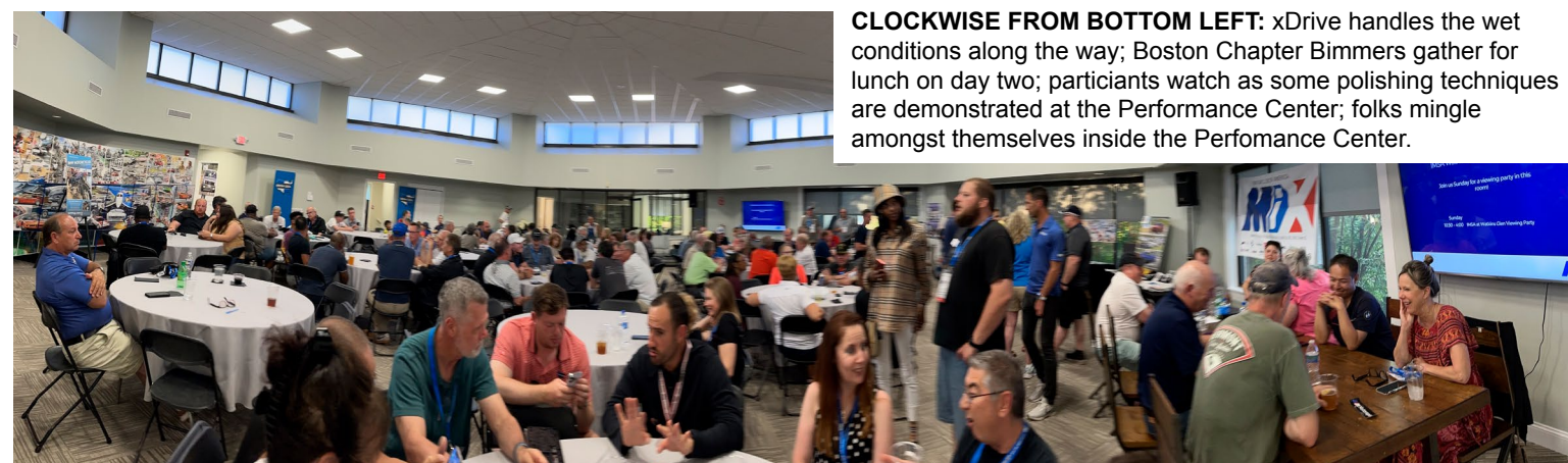
CLOCKWISE FROM BOTTOM LEFT: xDrive handles the wet conditions along the way; Boston Chapter Bimmers gather for lunch on day two; participants watch as some polishing techniques are demonstrated at the Performance Center; folks mingle amongst themselves inside the Performance Center.

After our event ended, I hitched a ride out to the winery where the driving tour was just starting to arrive. It was a beautiful afternoon and we all sat out at the picnic tables under a shaded area and sipped wine and nibbled on some good snacks.