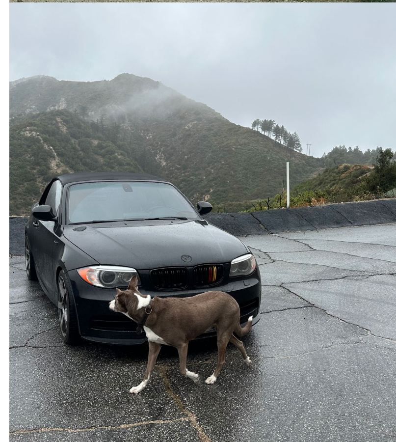
ABOVE: This 1er passes the smell test. LEFT: The treacherous truck trail.