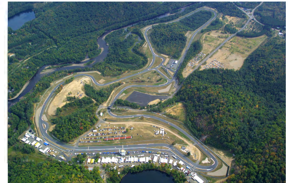
Le Circuit Mont Tremblant offers amazing track in a spectacular setting, making it a favored track for ADSS and HPDS programs.

We defer collection of event fees until about a month before the event and so you can register for as many events as your schedule allows without breaking the bank. All applicants are required to download the Tech and Medical forms and day of event information in order to have both car and driver prepared for the event. A tech inspection is recommended three weeks prior to an event.