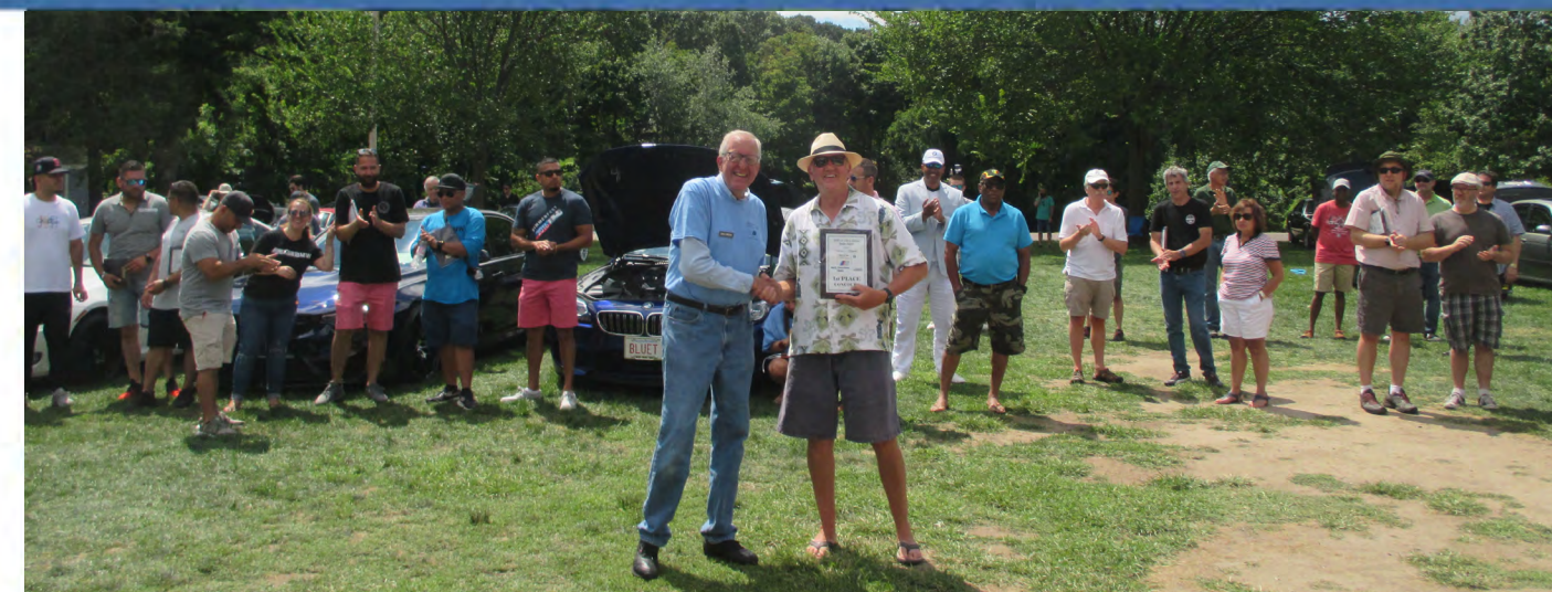
Everyone loves a car show, including the kids. Shown above is a scene from Concours, below a photo from the annual Rhode Island Fun Rally.

If you have an idea for a future program, drop the Activities Coordinator or any board member a note. The Chapter is always looking for new ideas.