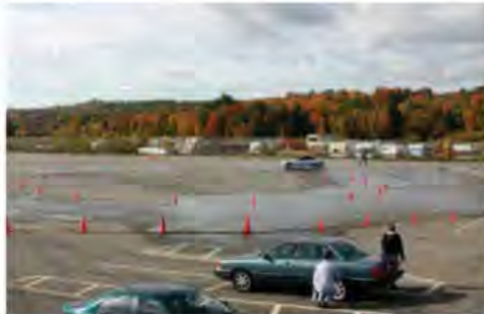
The course for Advanced Driving Skills School at New Hampshire Motor Speedway is a picturesque setting, especially in the fall, but offers challenging configurations with a lot of water.

At the end of the day the students get to put together all the skills that they have learned with numerous fun-filled runs through our combined exercise course. Students demonstrate braking while turning, inducing rotation,