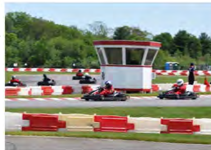
Many members tell us that karting offers the most bang for the buck. Seen here is a slice of the outdoor course the chapter uses during warm weather.

Our events at X1 Outdoors all take place on the nearly mile long Grand Prix circuit. The format for individual Sprint events is similar to the indoor karting challenge qualifiers described above, and the day's winner receives their trophy on the spot. Just like the Rolex 24 or Lemans, the winner of the Enduro is the team that completes the most laps at the end of the allotted time; and trophies are awarded to each member of the winning team.