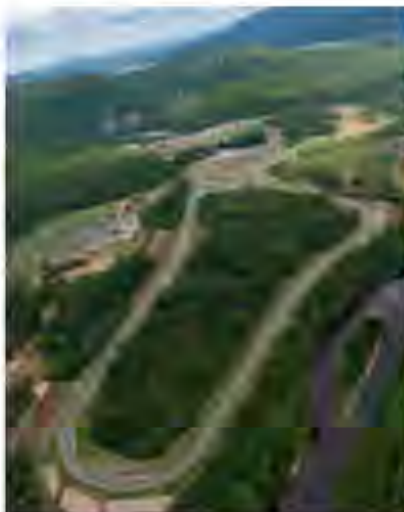
Le Circuit Mont Tremblant offers an amazing track in a spectacular setting making it a favored track for ADSS and HPDS programs.

We defer collection of event fees until about a month before the event and so you can register for as many events as your schedule allows without breaking the bank. All applicants are required to download the Tech and Medical forms and day of event information in order to have both car and driver prepared for the event. A Tech inspection is recommended 3 weeks before an event.