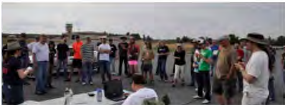
< Autocross drivers navigate a challenging course of cones and compete for the best time in class. Above, to get participants ready for the day, the driver's meeting is the first step in the day. The meeting is followed by a course walk since the course changes for each event.