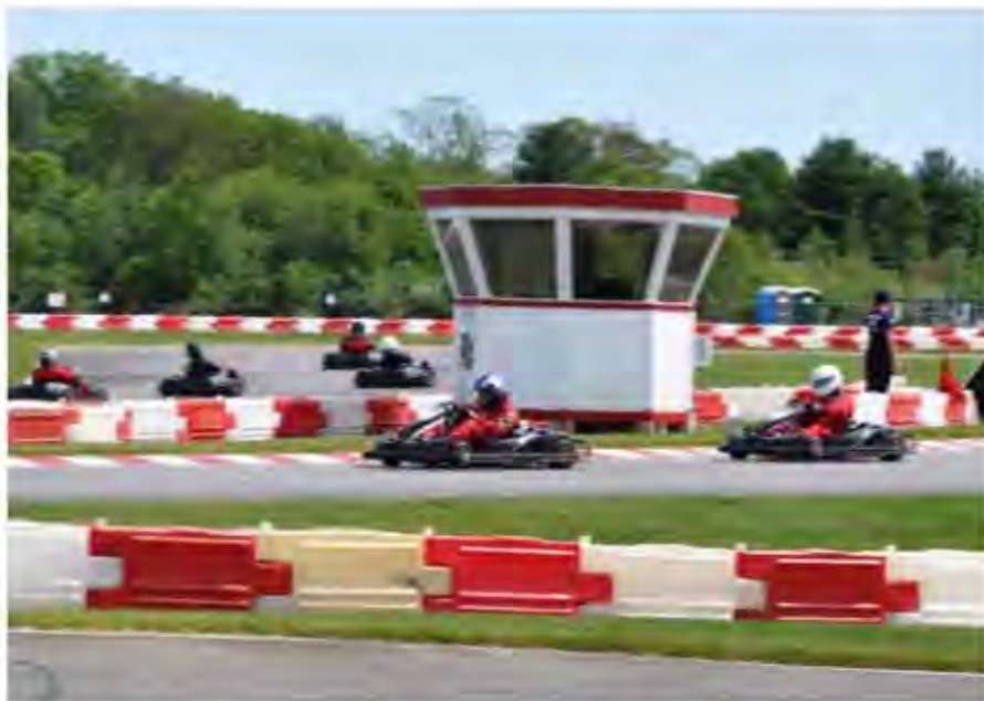
Many members tell us that karting offers the most bang for the buck. Seen here is a slice of the outdoor course the chapter uses during warm weather.

Our events at X1 Outdoors all take place on the nearly mile long Grand Prix circuit. The format for individual Sprint events is similar to the indoor karting challenge qualifiers described above, and the day's winner receives their trophy on the spot. Just like the Rolex 24 or Lemans, the winner of the Enduro is the team that completes the most laps at the end of the allotted time; and trophies are awarded to each member of the winning team.