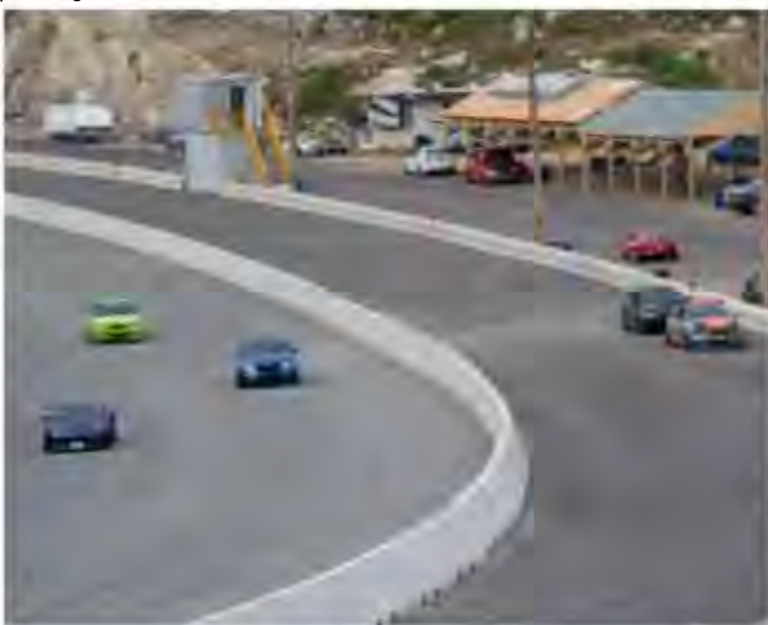
One of several venues for HPDS is the Palmer Motorsports Park, shown here during a Boston Chapter event in 2016.

What you learn on the track depends on your driving skill. Beginners are taught driving style (smoothness, consistency, the ability to read the track), more experienced participants continue to work on consistency, while developing new skills such as trail braking, and threshold braking. Every time you are on the track, you will have an experienced instructor in the passenger seat.