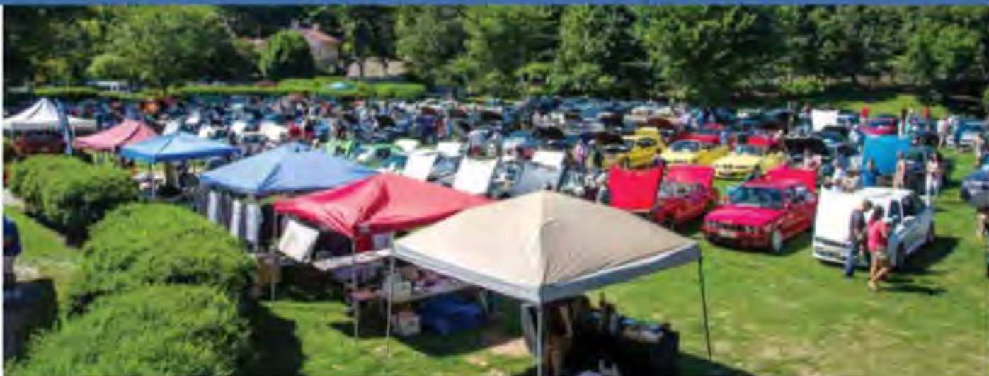
Everyone loves a car show, including the kids. Shown above is a scene from Concours, below a photo from the annual Rhode Island Fun Rally.